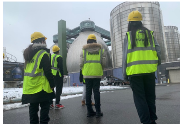
Students at Newtown Creek treatment facility in February 2023

JBS students traveled to Newtown Creek sewage treatment plant as part of their studies in a course called New York City Water. The course is a multidisciplinary study of water. Students learn about our local and regional water cycle while also reading and writing about environmental water justice.