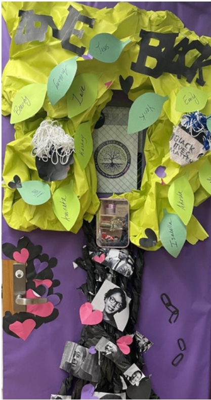
Black History Month Doors

“The purpose of education...is to create in a person the ability to look at the world for himself, to make his own decisions...” - James Baldwin